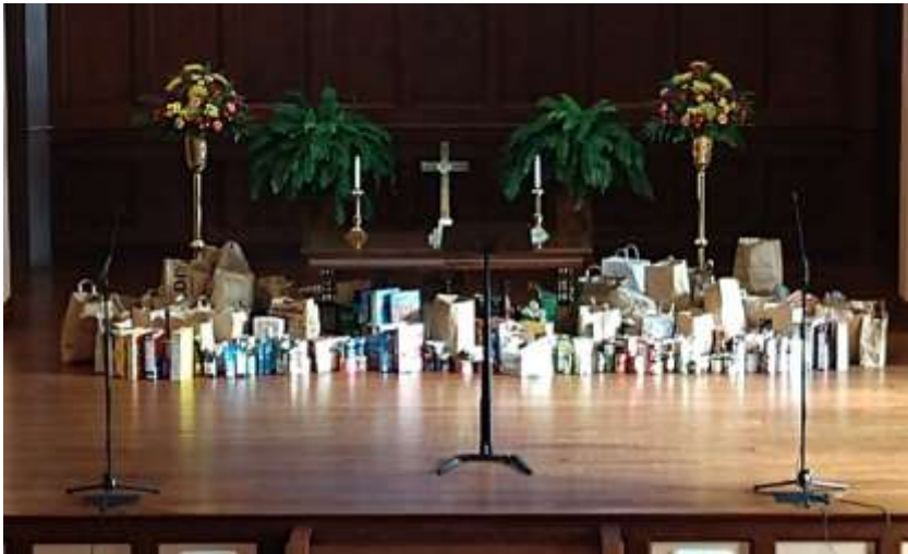
Just a portion of the items collected

In October the Asbury Angells Youth Group sponsored our first annual It's Spooky to be Hungry event, a non-perishable food drive. You all made it an incredibly successful event! We delivered 16 – 2'x2'x3.5' boxes FULL of non-perishables to Wesley Oak Church and Second Harvest. The youth were thrilled at the participation of our congregations and communities! We thank you for your help and support and look forward to having the It's Spooky to be Hungry event each October!