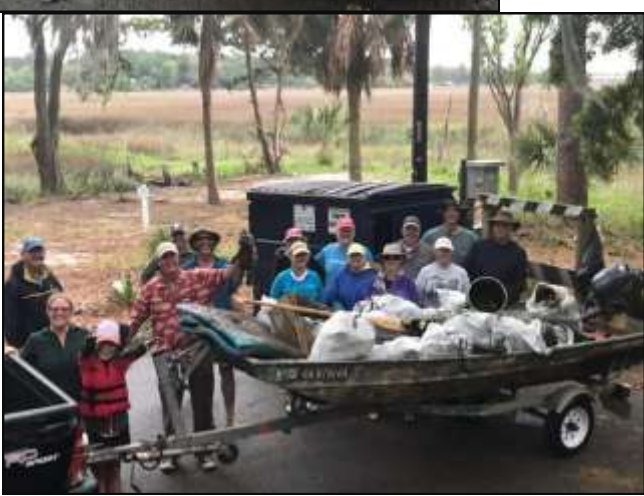
The Asbury Green Team organized a clean up of Hayners Creek. We collected a literal boatload of trash mostly single use plastic and Styrofoam.