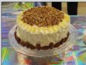
CLIFF HARLEY Hummingbird Cake (Category: Tasting)