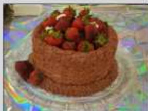
RAY ELLIS Strawberry Basket Cake (Category: Presentation)