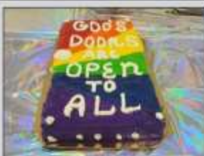
LINDA COMBS Vanilla Cake with Rainbow Icing (Category: Presentation)