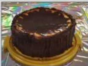
JASON ZIMMER Italiano Sopra il Cioccolato (Category: Tasting)