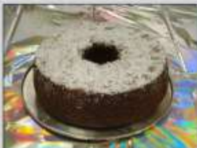
ANNE WESTBROOK GREEN Chocolate Chip Cake (Category: Tasting)