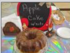
SHERRY GIDDENS Apple Cake with Nuts (Category: Presentation)