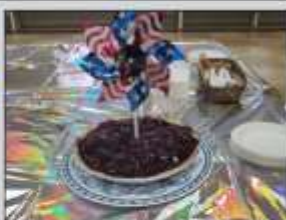
CONSTANCE COLEMAN Big Connie's Celebration Pie (Category: Tasting)