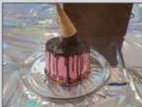
SAMANTHA TISINGER Melted Ice Cream Cone Cake (Category: Presentation)