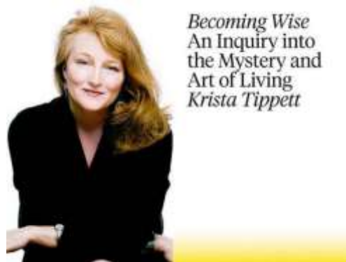
Becoming Wise An Inquiry into the Mystery and Art of Living Krista Tippett

Mondays at 1:00 pm for lunch, 1:30 for study