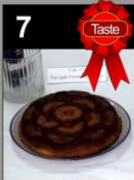
7 Pineapple Upside-Down Cake Bill Jahn