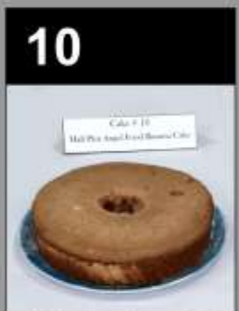
10 Half-Pint Angel Food Cake Pat Prokop