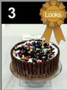
3 Candy Shop Ice Cream Cake Preston Hodges