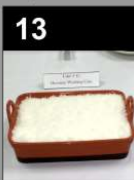
13 Hawaiian Wedding Cake Billy Aiken