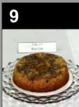
9 Rum Cake Wayne Bland