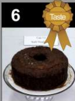
6 Apple Dapple Cake Kenn Waters