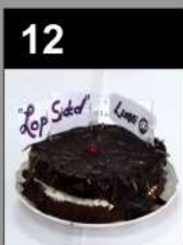
12 Chocolate Lime Cake Dwight Campbell