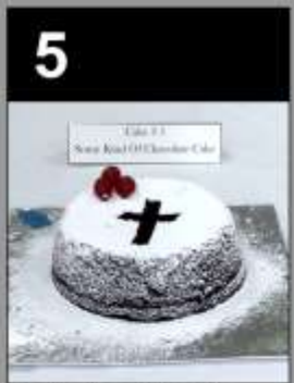
5 Triple Chocolate Cake Nick Deffley